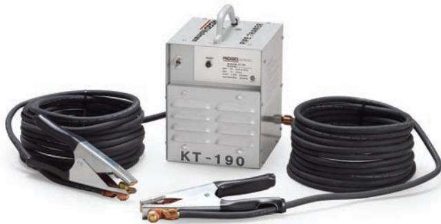
KT-190 Pipe Thawer