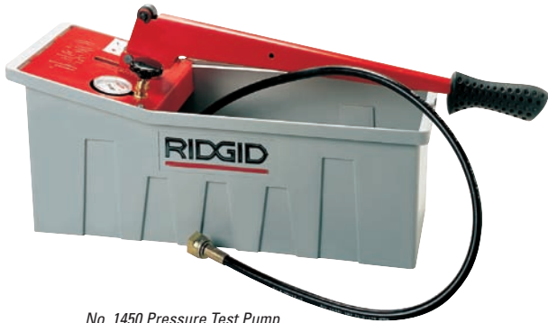
No. 1450 Pressure Test Pump