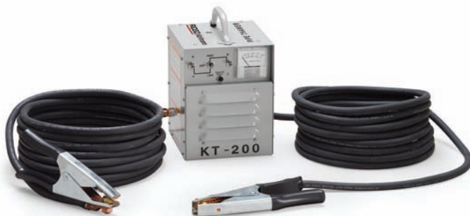
KT-200 Pipe Thawer