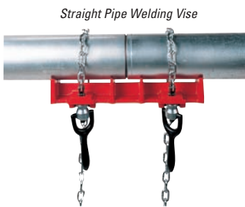
Straight Pipe Welding Vise