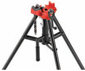
425 Portable Tristand Chain Vise