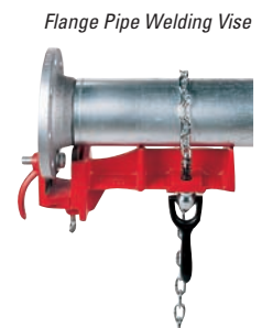
Flange Pipe Welding Vise