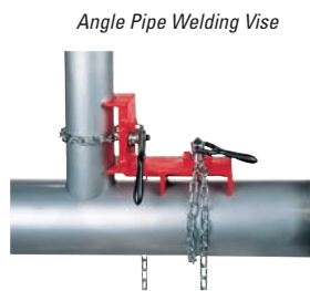
Angle Pipe Welding Vise