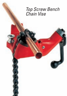
Top Screw Bench Chain Vise