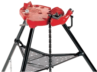
460 Portable Tristand Yoke Vise