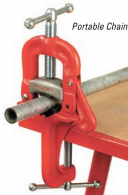
Portable Chain and Yoke Vise