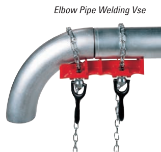
Elbow Pipe Welding Vise