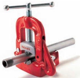
Bench Yoke Vise