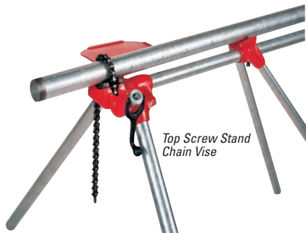
Top Screw Stand Chain Vise

**Jaw for Plastic Pipe, Catalog No. 41280 available; order separately. •Export Models require assembly.